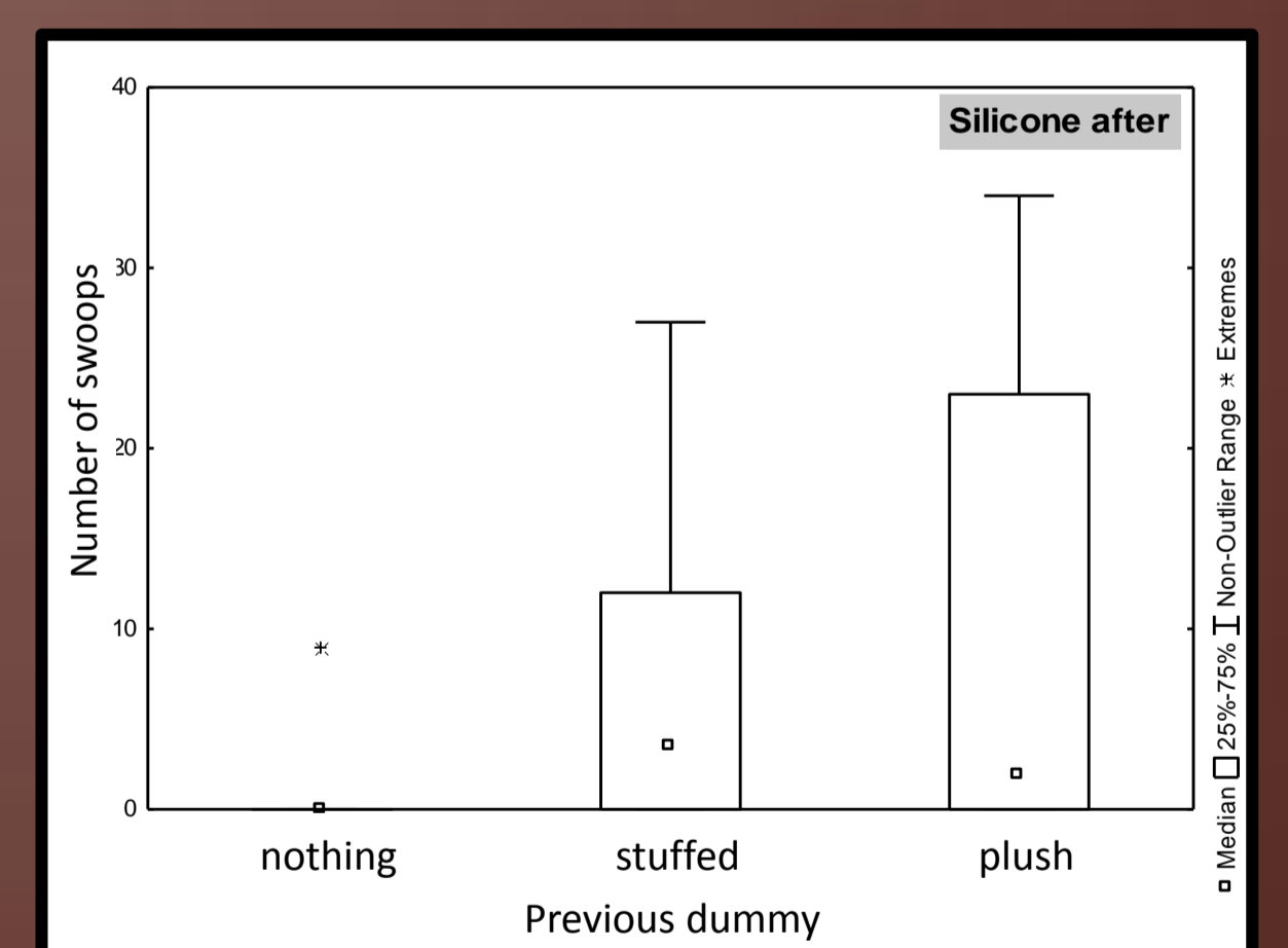
Fig. 3 – Intensity of active mobbing against silicone dummy dependent on previous trial (silicone after: nothing (n = 8), stuffed (n = 10), plush (n = 9)).